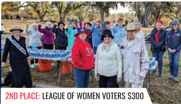
2ND PLACE: LEAGUE OF WOMEN VOTERS $300