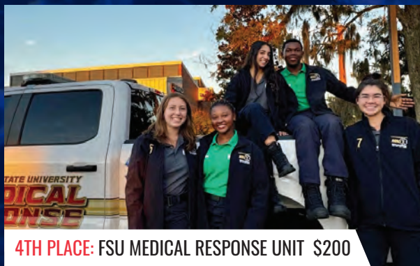
4TH PLACE: FSU MEDICAL RESPONSE UNIT $200