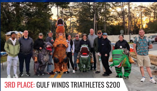
3RD PLACE: GULF WINDS TRIATHLETES $200