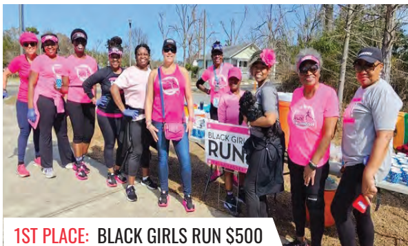
1ST PLACE: BLACK GIRLS RUN $500

As part of the Tallahassee Marathon & Half-Marathon, groups are invited to participate in the Water Station Challenge. This year there were 10 groups that sponsored and supported a water station for the runners. Duties included setting up the station, providing water, Gatorade, and Gu for the runners, and then helping to clear the station once all runners have passed. After the race, all participants were invited to vote on their favorite water station. Thank you for all the groups that participated. Here are the top four stations which will receive donations to a non-profit organization of their choice.